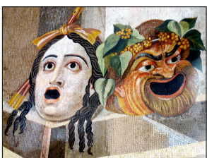
Tragic Comic Masks

Aristotle states that Aeschylus added the second actor, and that Sophocles added the third actor – in any event, the Greek playwrights never put more than three actors on stage at once.