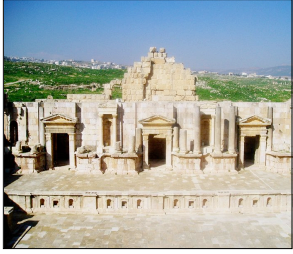
The stage of the South theatre in Jerash Jordan, the structure at the back is the skene

Aristotle states that Aeschylus added the second actor, and that Sophocles added the third actor – in any event, the Greek playwrights never put more than three actors on stage at once.